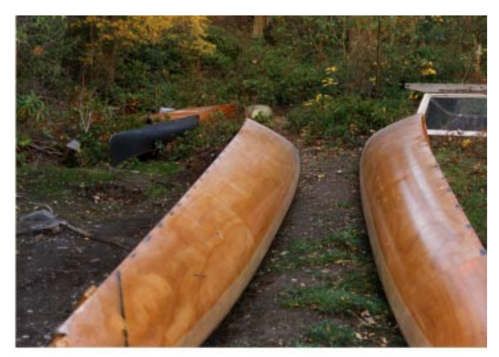
Smooth and Fair Hulls

cost. This technology should give one more of a chance to finish a boat before it becomes outdated, or the money runs out.