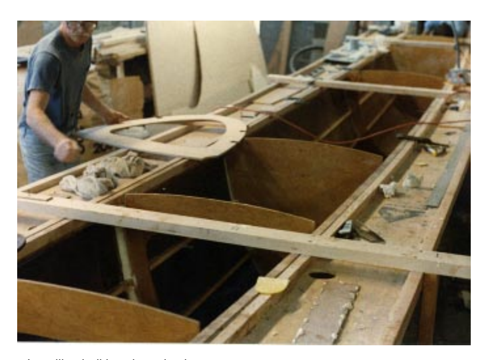
Installing bulkheads and stringers.

occurs on the underside of epoxied plywood/stringer decks. After the bilge wires are removed, and the edges trimmed, the keel has a layer of biaxial tape added to the outside. Any necessary filling is done at the sheers or keel, and the hull is sheathed with a layer of 4 oz. or 6 oz. glass cloth. A light, high performance hull can be built very quickly at low