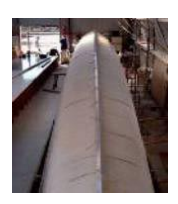
Which one is the KSS and which is the CM hull?